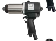
DynaTorque Manual Torque Multipliers