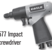
1577 Impact Screwdriver