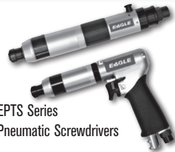
EPTS Series Pneumatic Screwdrivers