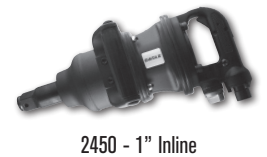
2450 - 1" Inline