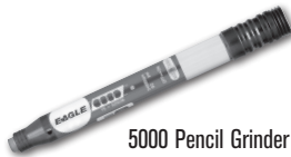
5000 Pencil Grinder