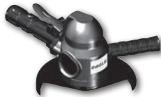
5040 Vertical Grinder