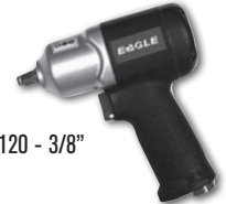
2120 - 3/8"