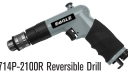
714P-2100R Reversible Drill