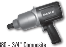
2380 - 3/4" Composite