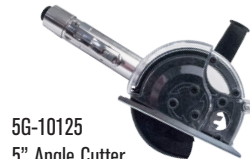
5G-10125 5" Angle Cutter