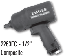
2263EC - 1/2" Composite