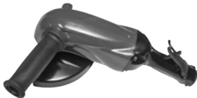
GAB 41 A85DW Pneumatic Grinder