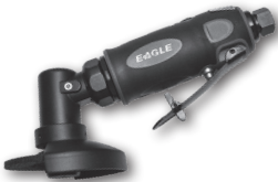
5205-2EC Angle Grinder